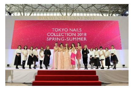
TOKYO NAILS COLLECTION 2018S/S

**Please refer to the separate news release on the 2019 spring and summer nail trend theme of "The Glass Art Craft."