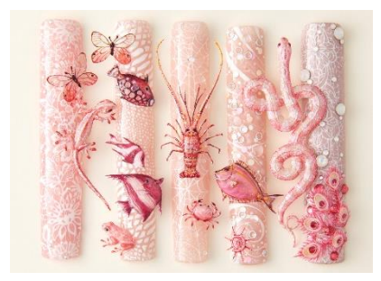
Tamami Sato, 1st of 2017

*The exhibition will be held over two days. Voting will end at 12:00 PM, Monday, November 12.